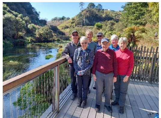
The group at the spring

Walks lined up for the remainder of the year include Killarney Lakes (near Te Aroha), Aongatete Loop Track (near Katikati) and another attempt at Daly's Clearing in Karangahake Gorge (depending on weather). We will try to fit in a longer day trip to scale Karioi at Raglan over the summer.