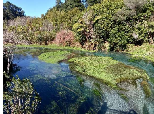
Beautiful clear water