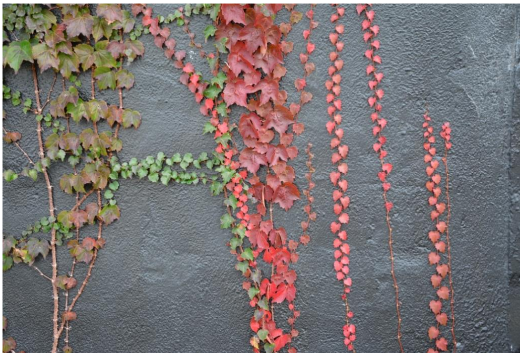
Hamilton Gardens